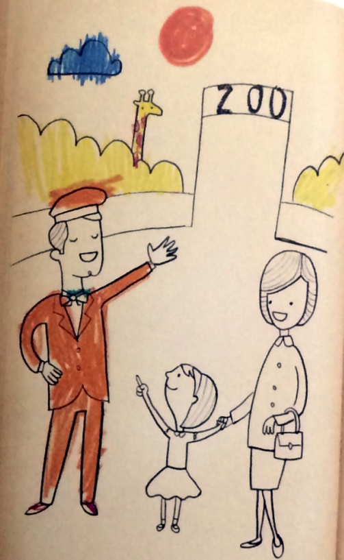
Meet the Zookeeper